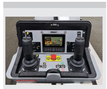
XPC controls with up to 4 actions at a time (2 per joystick)