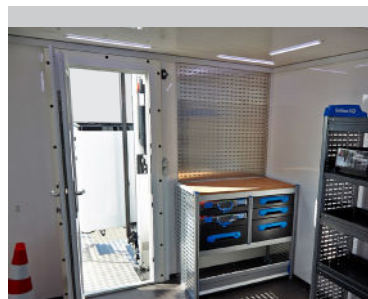
Workshop interior (optional)